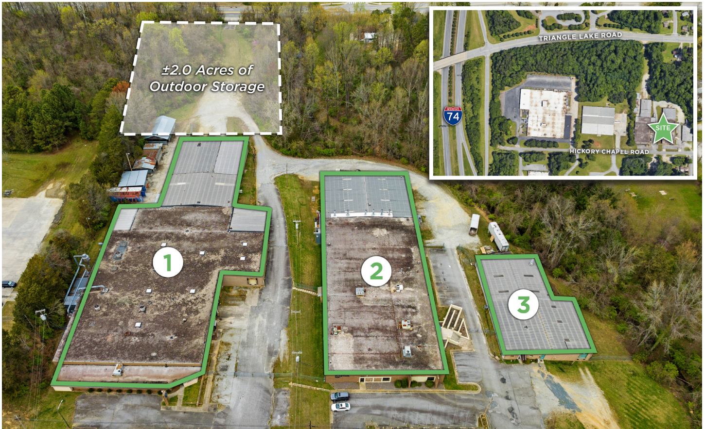
*Building 1 + Outdoor Storage: Pricing Available Upon Request