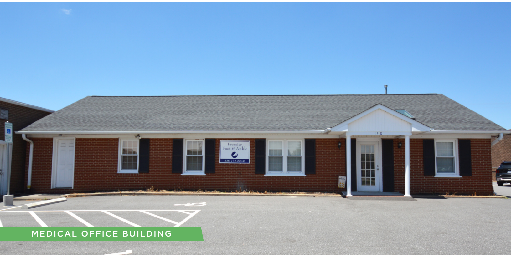
MEDICAL OFFICE BUILDING