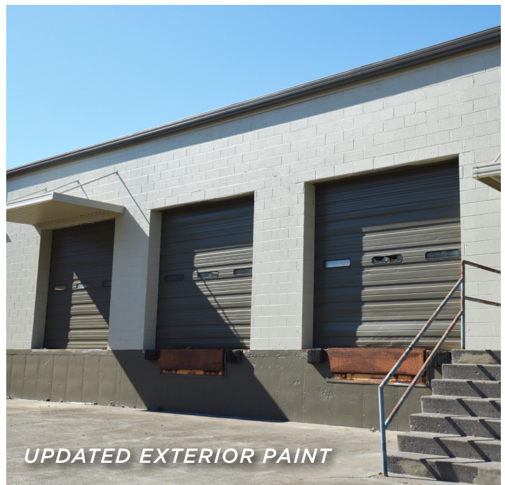
UPDATED EXTERIOR PAINT

3.5-4.0 acres of fenced, gated, outdoor storage and/or parking. ±25,207-96,248 SF of flex/industrial space spread across 4 buildings. Future projects and improvements will allow for more outdoor storage on the ±9.06 acre property. 5 dock-high doors and 3 drive-in doors in allow for various flex/industrial uses. Building 1 and 2 share an industrial dock lift. Ideal site logistics at 1.0 mile from I-40 and 1.5 miles from US-52.